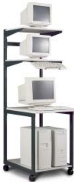
21124 24" LAN Station (shown with optional casters and keyboard support)