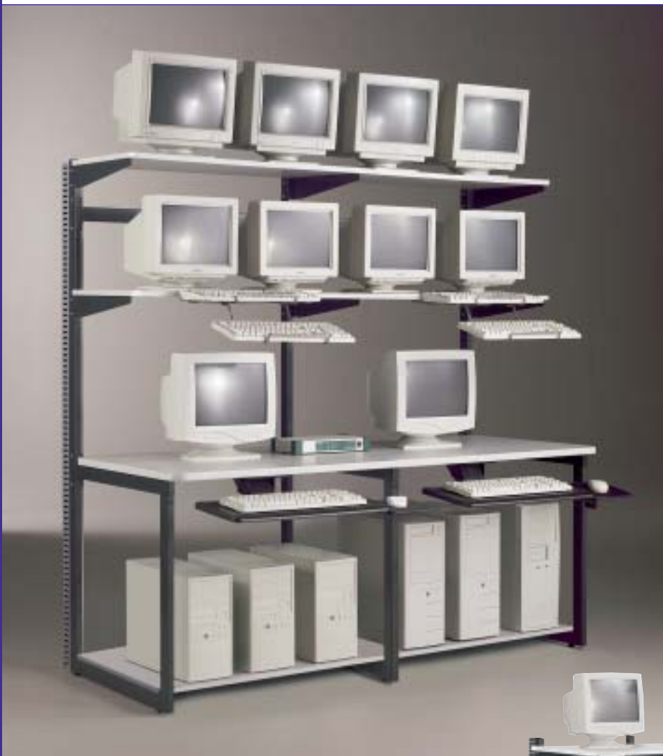
21172 72" LAN Station shown with optional keyboard supports and cable management channel.