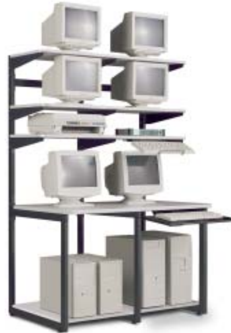
21148 48" LAN Station (shown with optional keyboard supports and additional shelf)

FRAME: 1" X 2" 14-gauge cold-rolled steel tubing, tested to 1000 lbs. per 24" frame without failure.