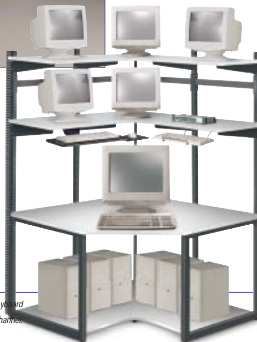
211CNR Corner Unit shown with optional keyboard supports and cable management channel.

The e*LAN Racking System is an EFFICIENT, COST-EFFECTIVE solution for network storage. Five standard configurations meet virtually any need and SHIP COMPLETE IN ONE CARTON. Stations feature spacious worksurfaces, FULL-WIDTH SERVER SHELVES and multiple equipment shelves that adjust in 2" increments. It's simply the BEST VALUE on the market for open racking systems! Add or take away shelves as your needs change. Optional 2" diameter locking casters are easy to install and allow the stations to become mobile.