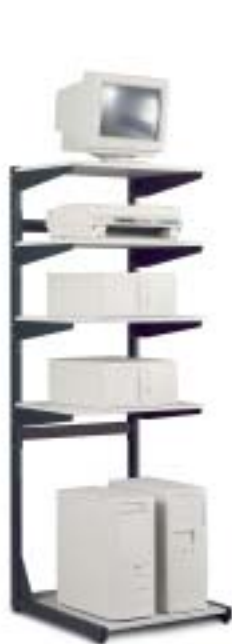
21145 24" Server Station