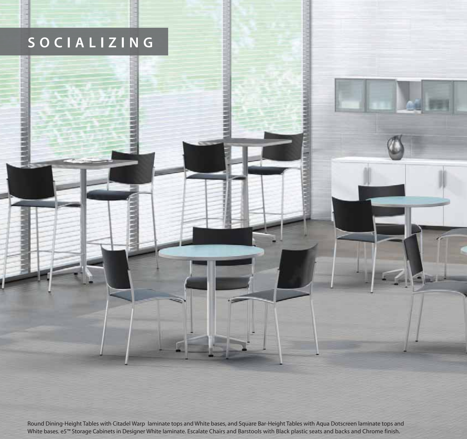
Round Dining-Height Tables with Citadel Warp laminate tops and White bases, and Square Bar-Height Tables with Aqua Dotscreen laminate tops and White bases. e5™ Storage Cabinets in Designer White laminate. Escalate Chairs and Barstools with Black plastic seats and backs and Chrome finish.