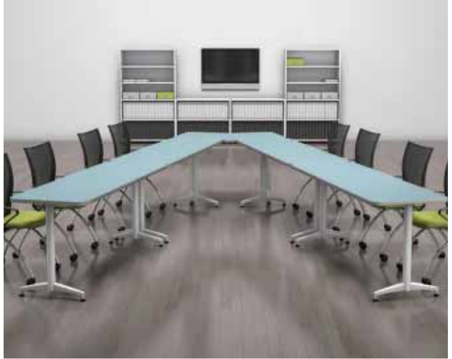
This V configuration ensures a clear view for everyone at the table. Fixed-Height Tables with Aqua Dotscreen laminate tops and White bases. e5™ Storage Cabinets in Designer White laminate. Valore® Training Seating with Expo Sprout fabric and Chrome finish.