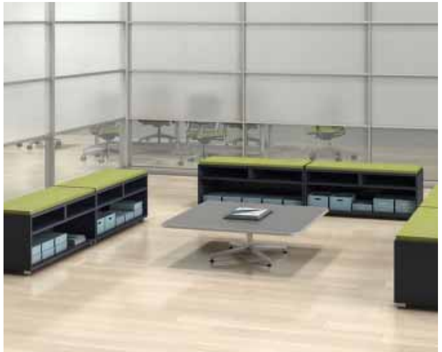
Coffee Table with Citadel Warp laminate top and Silver base serves as the focal point for this casual collaboration space outside a formal conference room. Shown with e5™ Lower Storage Cabinets in Raven laminate with Expo Sprout fabric cushions.