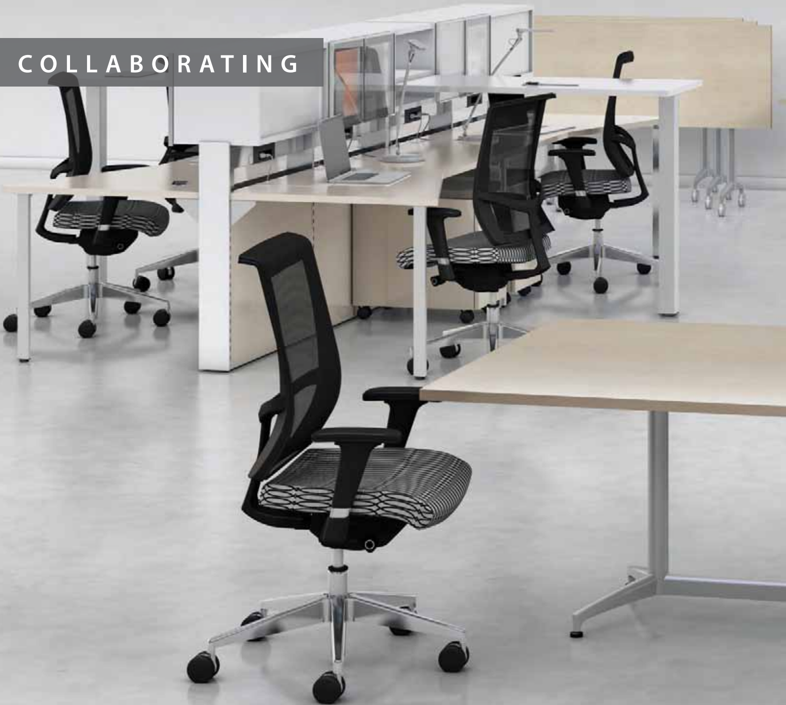
Conference Table (foreground) and Flip & Nest Tables with Summer Suede laminate tops and Silver bases. e5™ Collaborative Furniture with Summer Suede and Designer White laminates, and Silver finish. Commute™ Task Seating with Flection Foil fabric and Chrome finish.