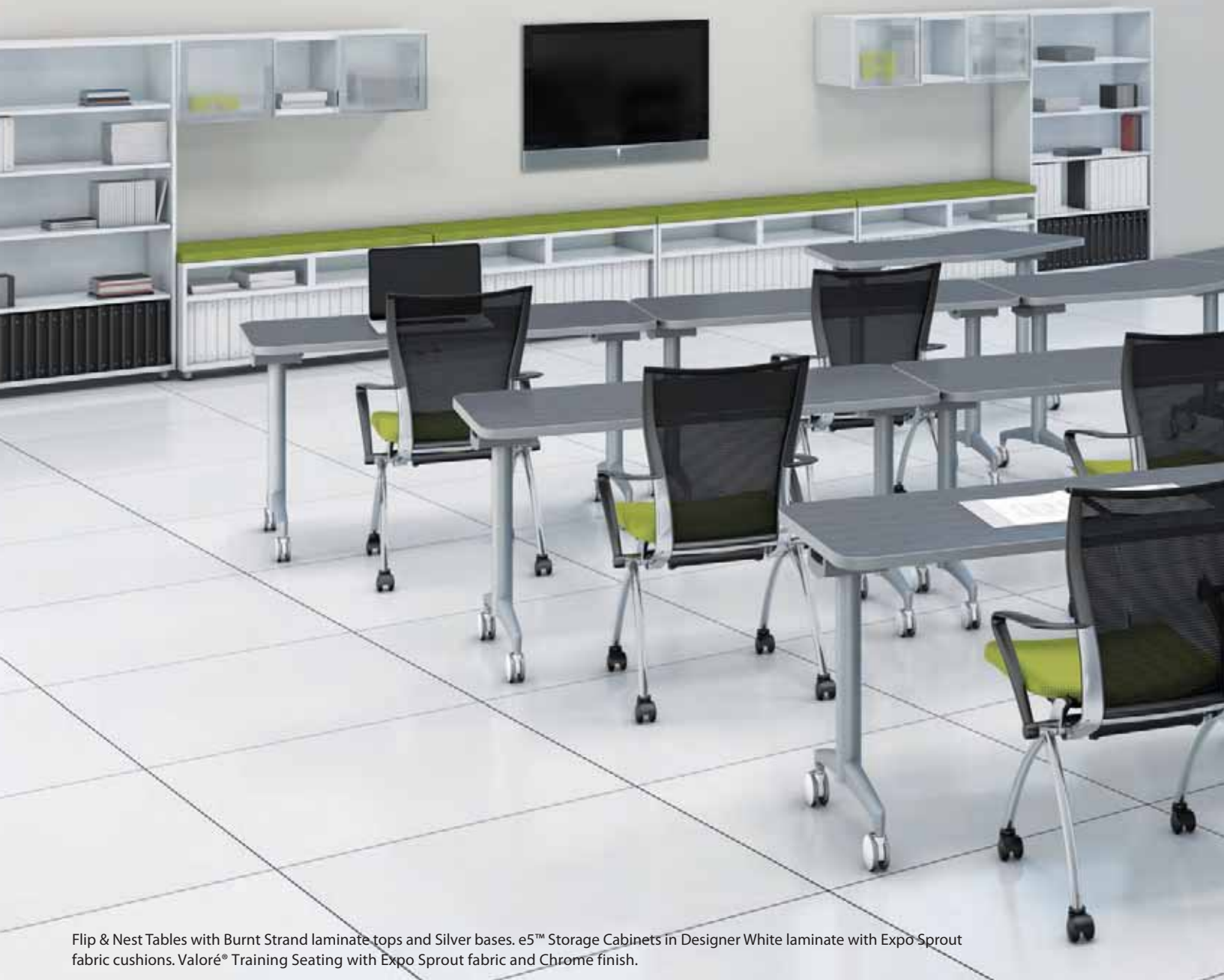
Flip & Nest Tables with Burnt Strand laminate tops and Silver bases. e5™ Storage Cabinets in Designer White laminate with Expo Sprout fabric cushions. Valoré® Training Seating with Expo Sprout fabric and Chrome finish.