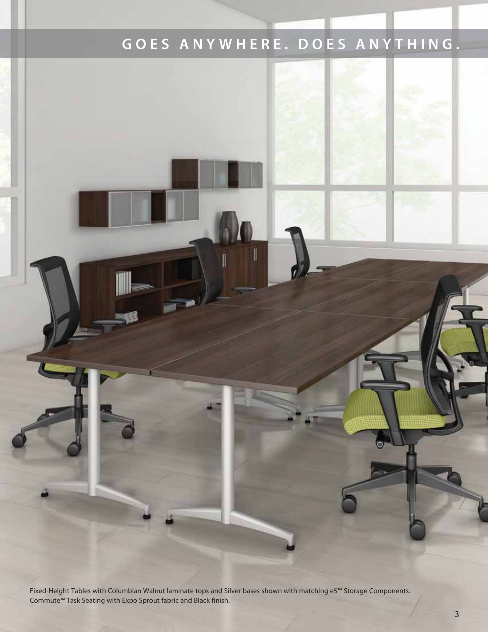
Fixed-Height Tables with Columbian Walnut laminate tops and Silver bases shown with matching e5™ Storage Components. Commute™ Task Seating with Expo Sprout fabric and Black finish.