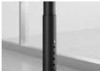
Pin-Height Adjustable Tables offer 8" of vertical spring clip adjustability.