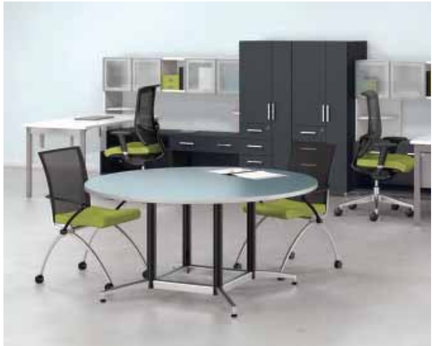
Round Conference Tables are offered in three sizes. Conference Table with Aqua Dotscreen laminate tops and Black and Aluminum base. e5™ Collaborative Furniture in Designer White and Raven laminates. Valore® Training Seating with Expo Sprout fabric and Chrome finish.