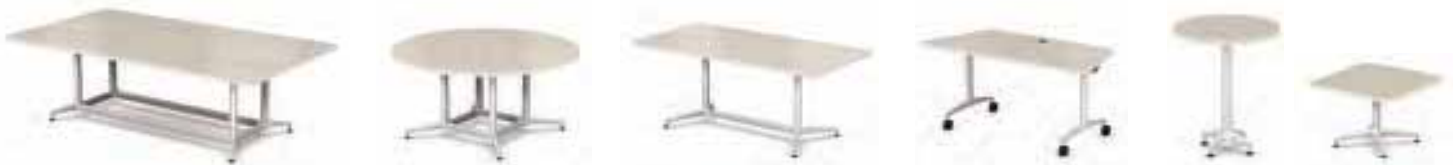
Ace of Bases. Different tables offer different base options, each of which beautifully complements the others. Bases are available in a black, silver or white powdercoat finish, with optional polished aluminum feet.