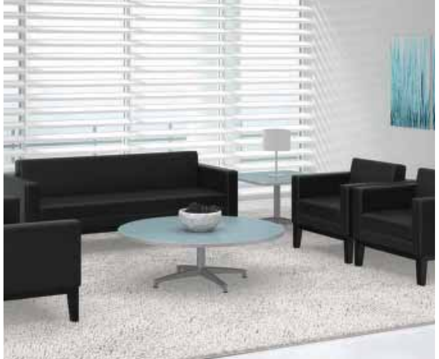
Coffee Table and End Table with Aqua Dotscreen laminate tops and Silver bases – a beautiful complement to Prestige Lounge Chairs and Sofa in Black Leather and Black finish (available 2014).